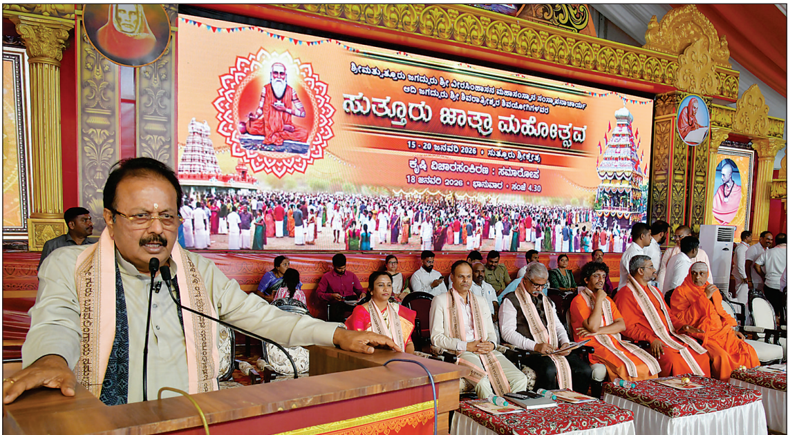
Minister Sri N. Chaluvaryaswamy is speaking in the gracious presence of H.H. Jagadguruji at the valedictory of Agricultural Conference held during Jathra Celebrations. (January 18, 2026)