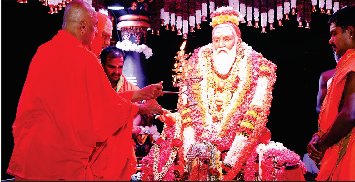
The Teppostava, (Grand Floating Festival) of Adi Jagadguru Sri Shivarathreeswara Shivayogi Mahaswamiji was inaugurated at the river Kapila in connection with the Jathra Celebrations in the gracious presence H.H. Jagadguruji and H.H. Jagadguruji of Adichunchanagiri. (January 19, 2026)