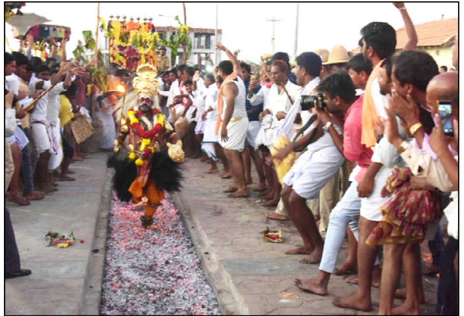
Holi Kondothisava celebrated in Sutturu Jathra Mahotshava here on Monday