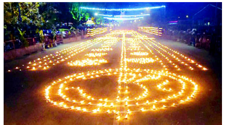
Laksha Deepotsavsava celebrated in Sutturu Jathra Mahotshava here on Monday.