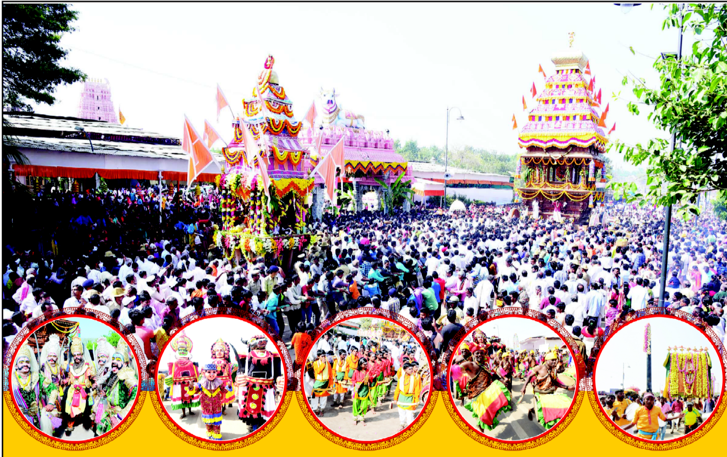
The Famous Sutturu Rathothsava was Witnessed by Thousand of Devotees here on Sunday.