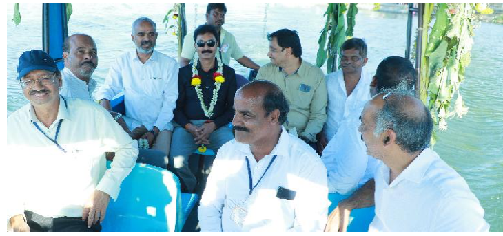
The Officials of Karnataka State Tourism and Development (KSTD) inaugurated the Boating and took a first ride, during the Sutturu Jathra Mahotsava.