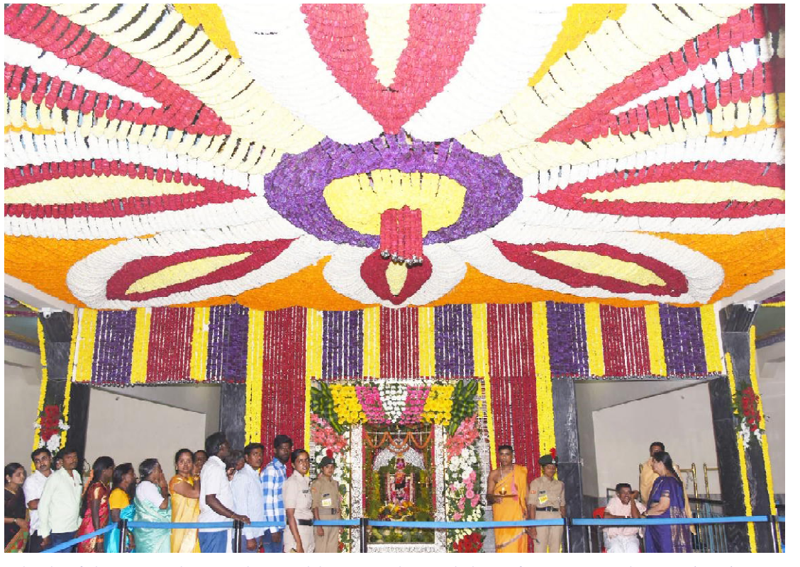
Flock of devotees throng the Gadduge on the 2nd day of Sutturu Jathra Mahosthsava.