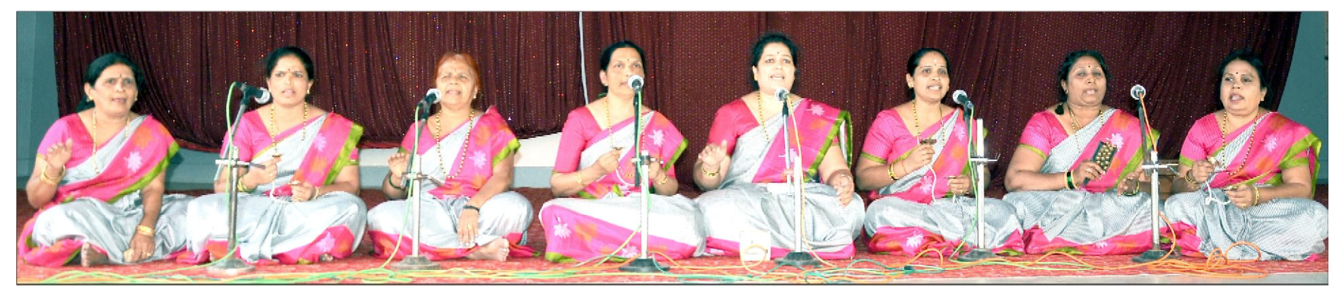
A Bajana Troup singers took part in the State Level Bajana Mela during the Suttur Jathra Mahothsava.