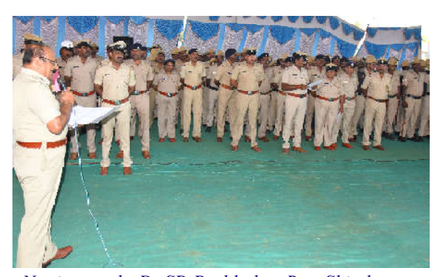
Nanjanagudu Dy.SP Prabhakar Rao Shinde seen briefing the Policemen during Jathra regarding the security measures.