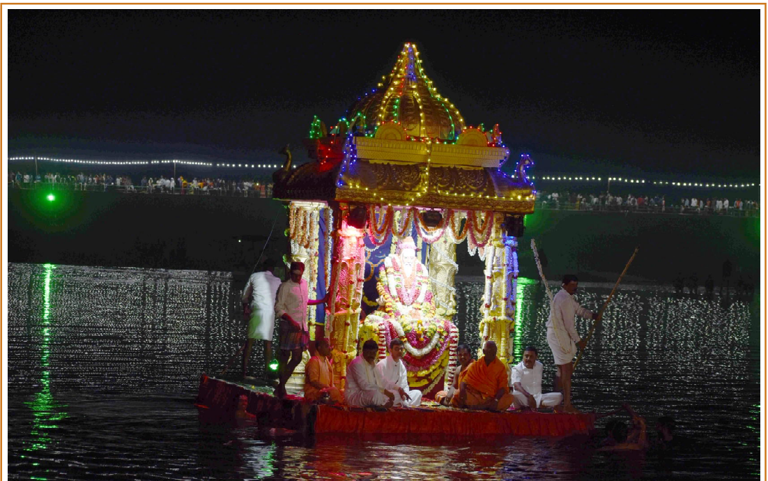
The gilded-up Theppa (Boat) took a circular round across the Kapila river, during the Theppotsava on the 6th day of Jathra