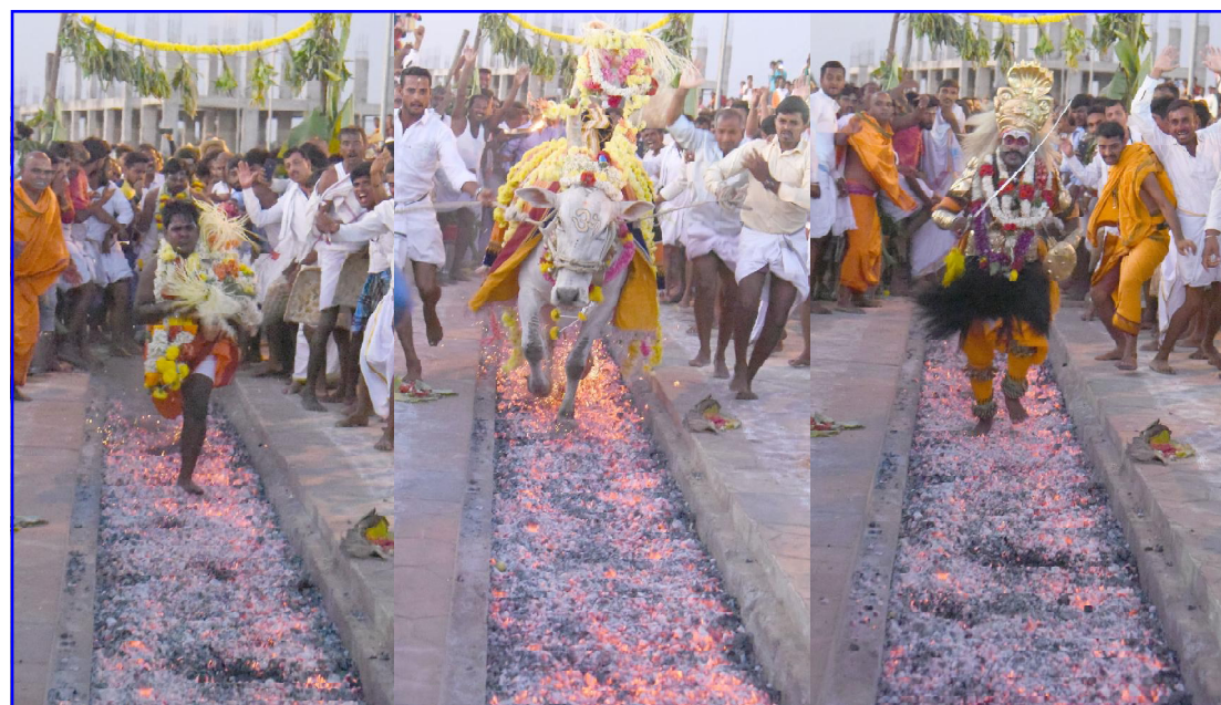
Sri Mahadeshwara Kondothsava